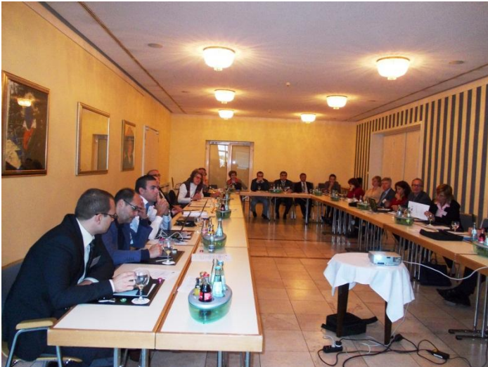
Final Conference, Bucharest 10 December 2012

Partners meeting in Bonn, 11 October 2012