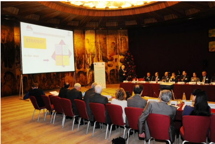
Partners meeting, Bucharest 11 December 2012